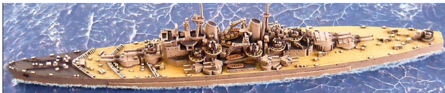
GHQ's 1:2400 UKN46 VANGUARD, British BB 1946