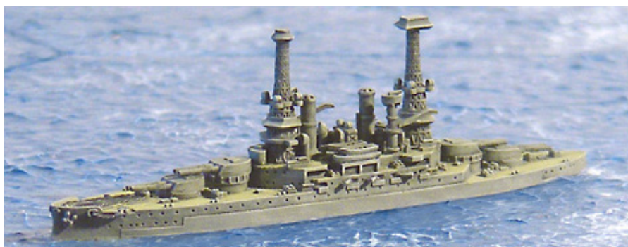
GHQ's 1:2400 GWS11 SOUTH CAROLINA (BB-26), U.S. BB