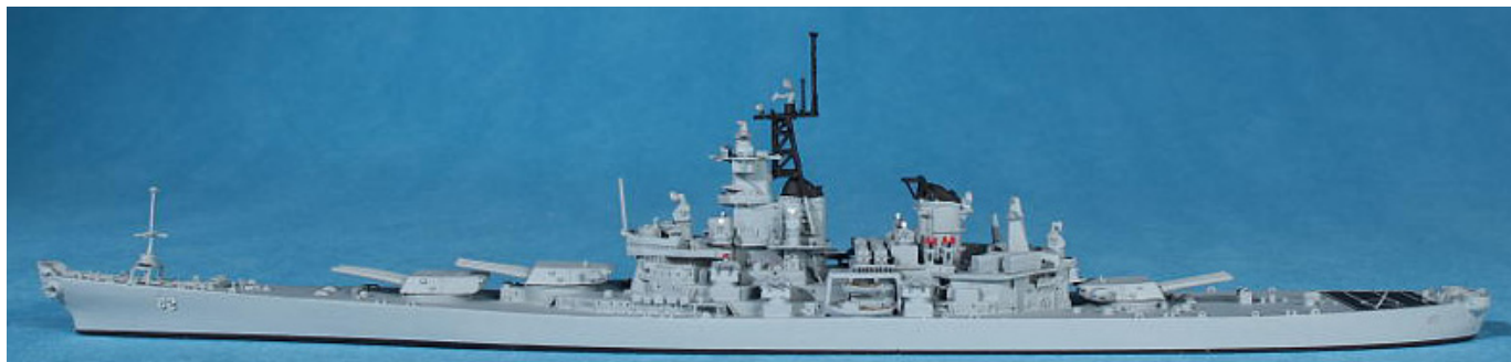
Neptun's new 1:1250 2301 NEW JERSEY (BB-62), U.S. BB 2007