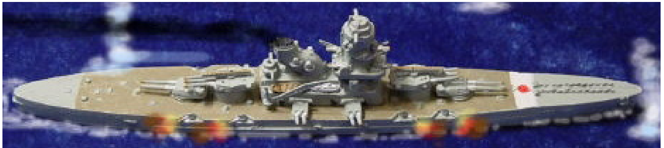
Superior's 1:1200 J115 HIRAGA, Japanese "Never-was" BB; Photo & paint job by Bobby Weymouth