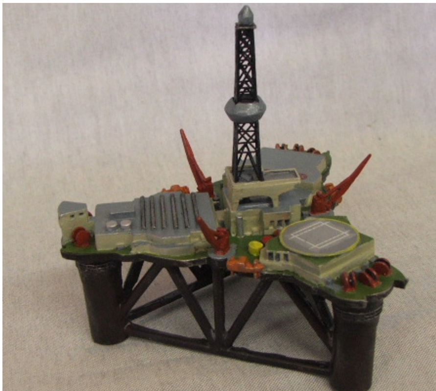
Mountford's 1:1200 MM266KP North Sea Oil Drilling Rig