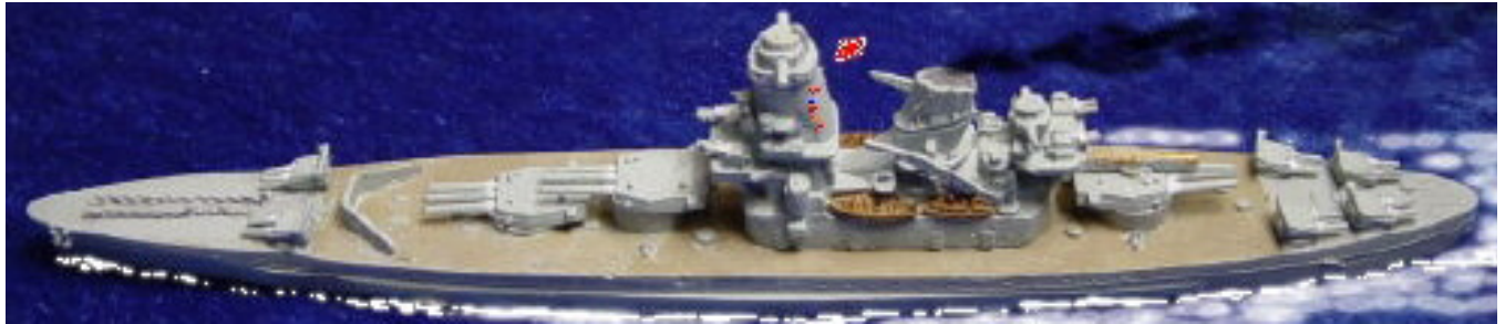
Superior's 1:1200 J114 FUJIMOTO, Japanese "Never-was" BB; Photo & paint job by Bobby Weymouth