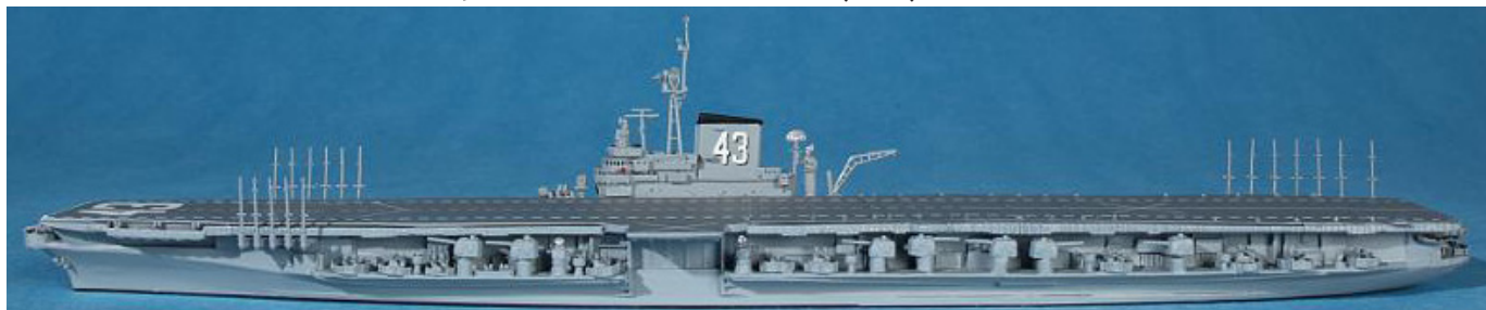
Neptun's new 1:1250 2311 CORAL SEA (CVA-43), U.S. CVA 1950