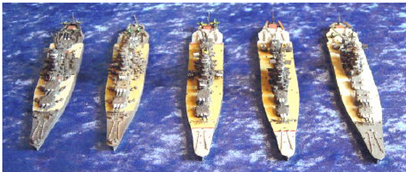
Design variants of the YAMATO class Japanese BB's; Right to Left: J111 Design A140, J112 Design A140A2, J113 Design A140B2, J107 YAMATO (Final Design), J109 Design A150 "Super Yamato"; Photo and model painting by Bob Weymouth

Phone: 1-800-446-4422 • Fax: 1-757-442-4343 • email: alnavco@esva.net • web: www.alnavco.com