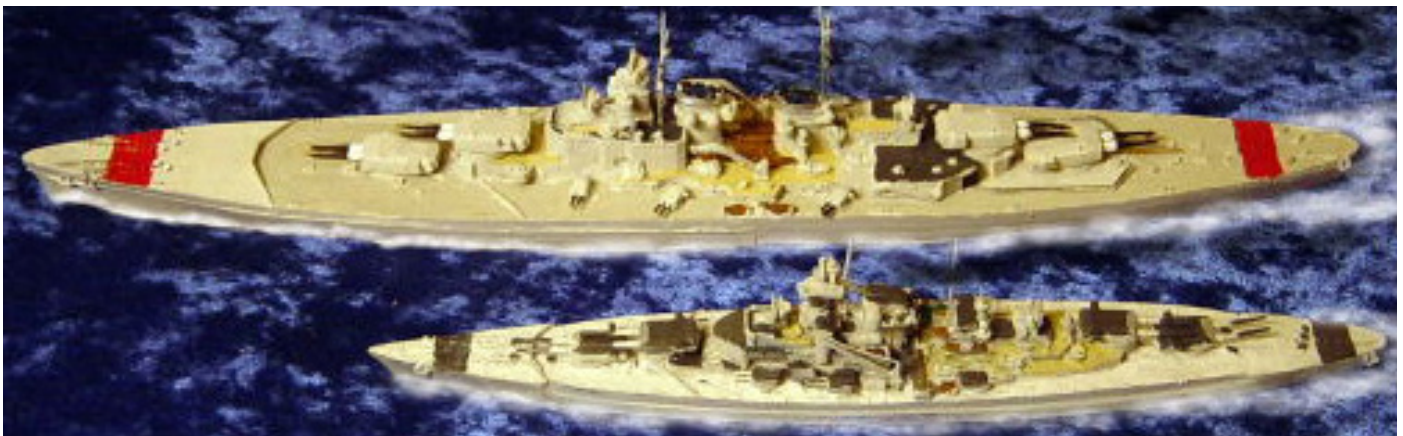
The proposed monster "Never-was" G105 German 128,930 ton, 1200 foot long Battleship Design H44 with its 9-20" guns steams next to the German Battleship G101 BIS-MARCK which was the largest that the Germans actually built displacing 41,700 tons, 792 feet in length and carrying an 8-15" main battery.

Also, if a model(s) you want isn't available at a particular time, order it anyway. They will be put on backorder for you and if we accumulate enough orders for a particular model, we will take it out of its normal "rotation" and produce it.