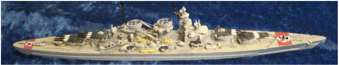
German BB design: G103 H39, 12-15"; G104: G103 with 8-16" circa 1939

F901 NORMANDIE , BB 1916 25,230 tons, 12-13.4"